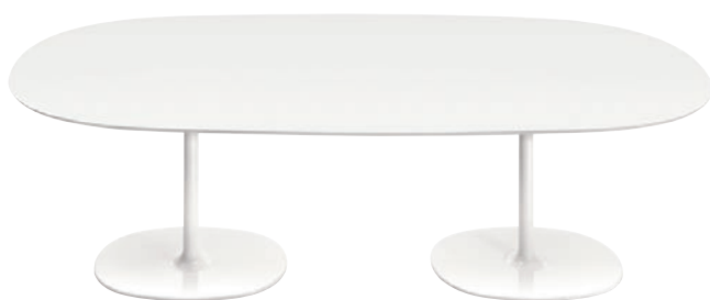
Table with double oval base in chromed or white lacquered steel and oval top in white embossed MDF available in sizes 250 x 121 and 300 x 131 cm. Height 74 cm.

Art. 0665: Mdf MD 131 x 300 cm - 51 5/8" x 118 1/8" Art. 0666: Mdf MD 121 x 250 cm - 47 5/8" x 98 3/8" Art. 0699: LM 124 x 300 cm - 48 7/8" x 118 1/8" Art. 0637: LM 121 x 250 cm - 47 5/8" x 98 3/8"